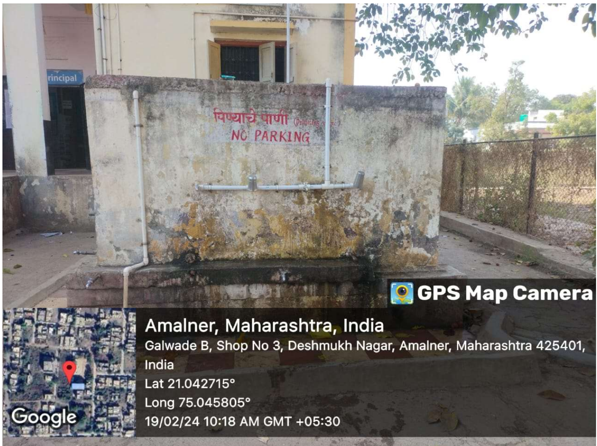
Drinking Water Tank