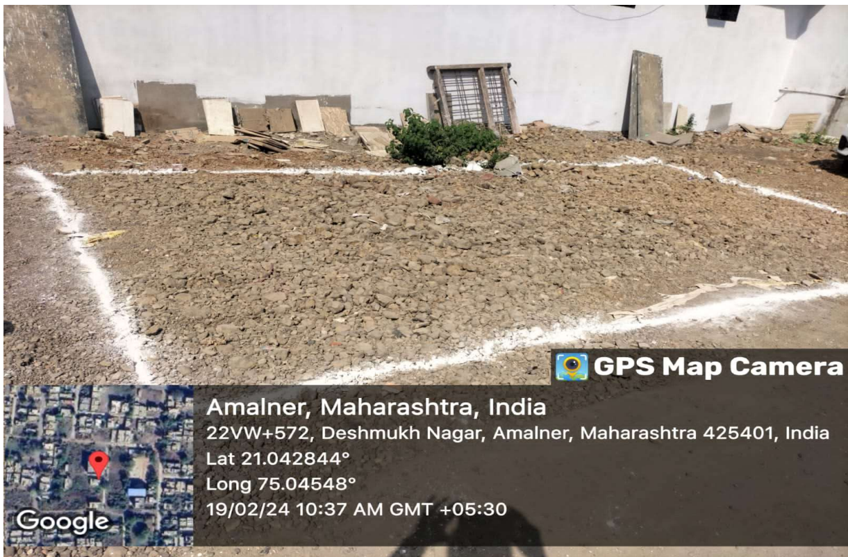
Erosion Pit on Rain Water Harvesting