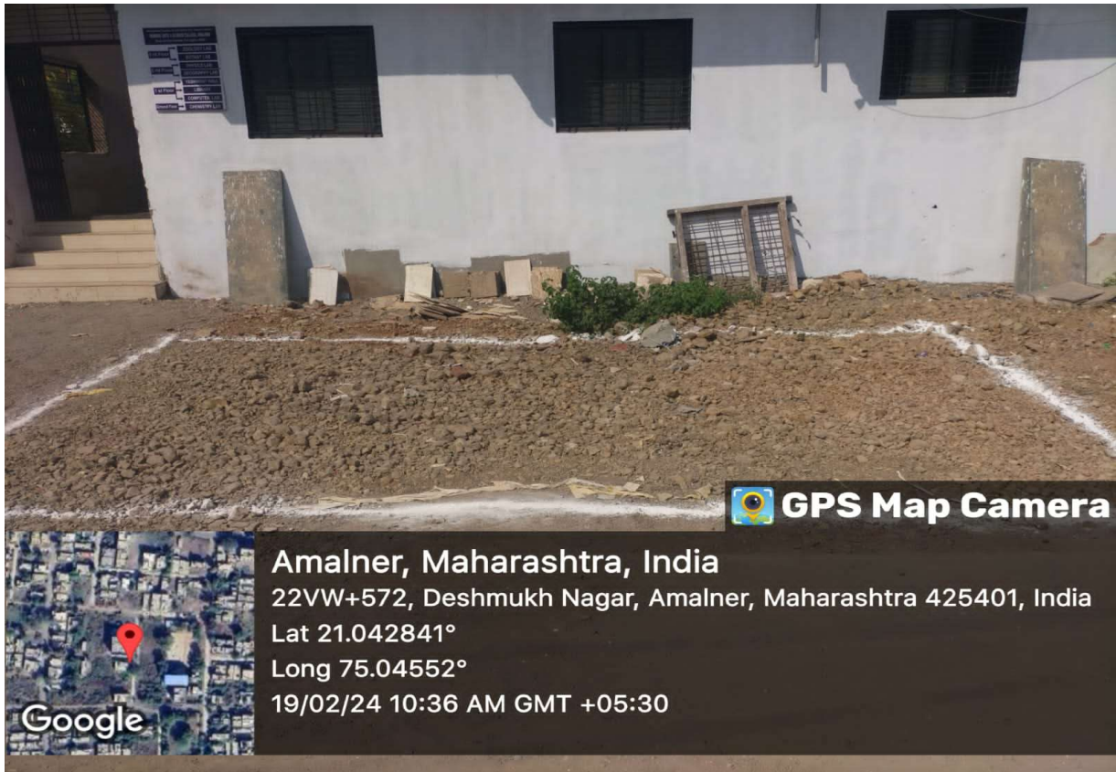
Erosion Pit on Rain Water Harvesting