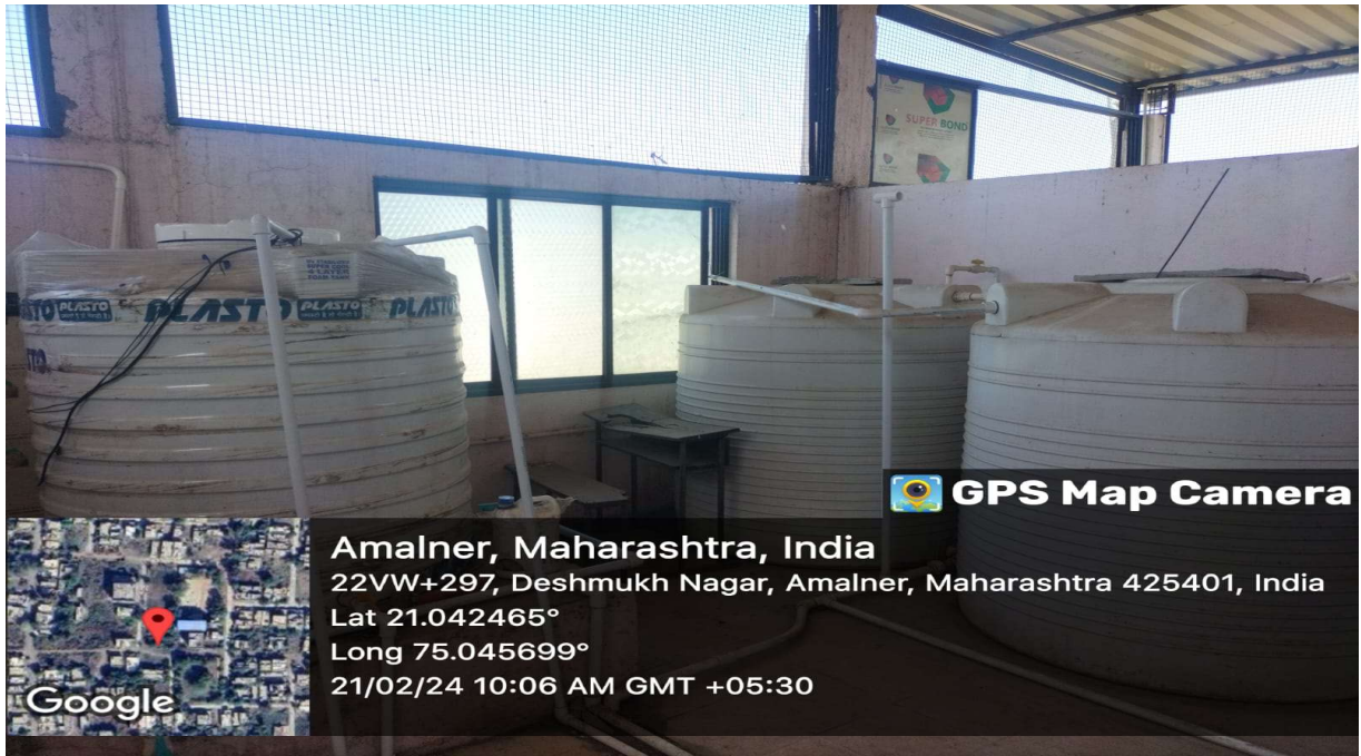
Water Purifier Tanks