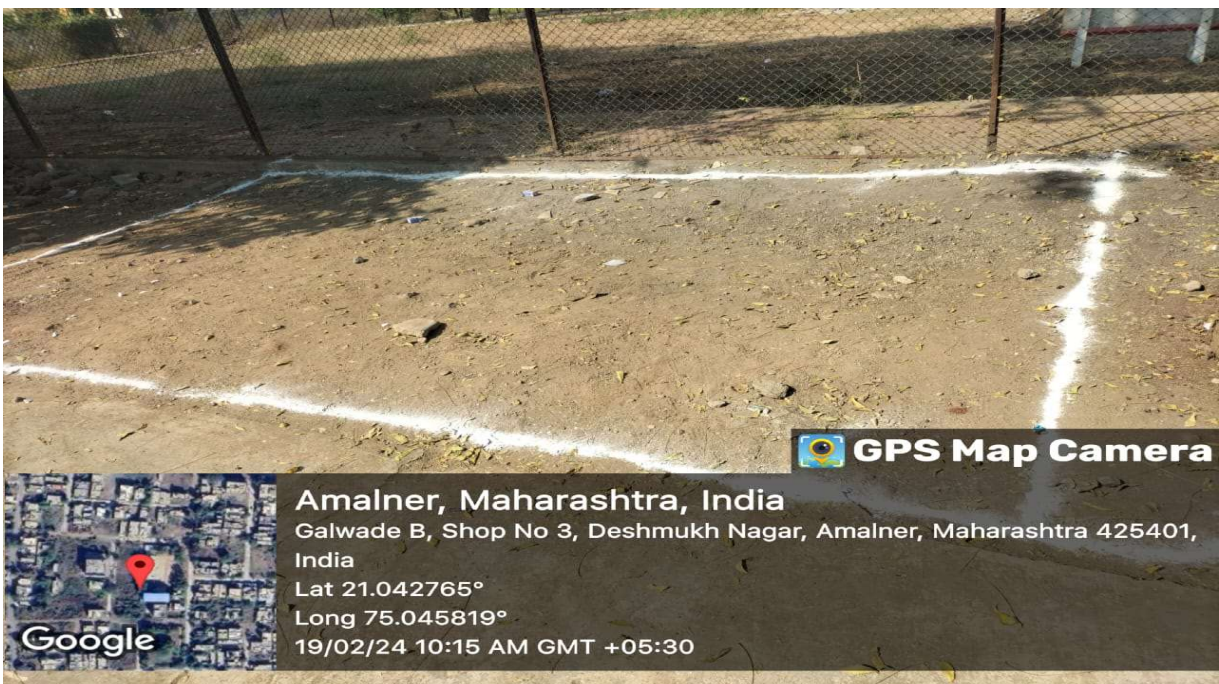
Erosion Pit on Rain Water Harvesting